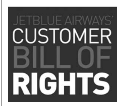
Fig. 3 for Question 3

JetBlue is dedicated to making every part of your experience as simple and pleasant as possible. Unfortunately, there are times when things do not go as planned. If you are inconvenienced as a result, we think it is important that you know exactly what you can expect from us. That's why we created our Customer Bill of Rights. These Rights will always be subject to the highest level of safety and security for our customers and crew members.